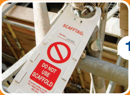
Step One: The empty holder clearly displays the message “Do not use”.

The Scafftag Status Tagging System is so simple to implement, easy for workers to understand, and highly visible for all to see. Just follow the three steps below to help keep your site safe: