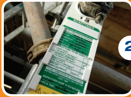
Step Two: When equipment is inspected, the insert is completed and then placed in its holder. This is then visible for all workers to see.